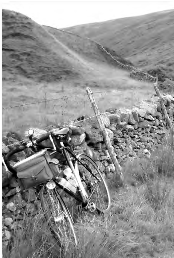
Coho in Scotland; LEL 2009.