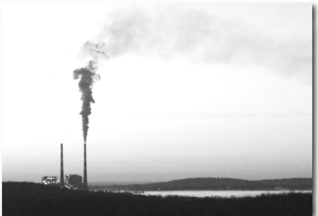
The steam plume from the La Cygne power generating station was going straight up and stalling at a few hundred feet, backlit by the eastern twilight; confirmation of the lack of wind. Before the ride was officially in the record books, Gates would be treated to the "ultra-rare, super-special, double-tailwind."

Editor's note: This article originally appeared on Gates' blog at www.commuterDude.com Photos by Randy Rasa, RUSA #5948, courtesy of www.theDirtBum.com and www.KansasCyclist.com .