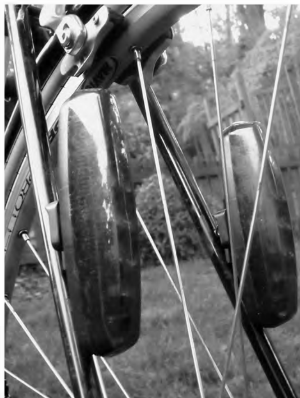
Braze-ons for dual tail lights.