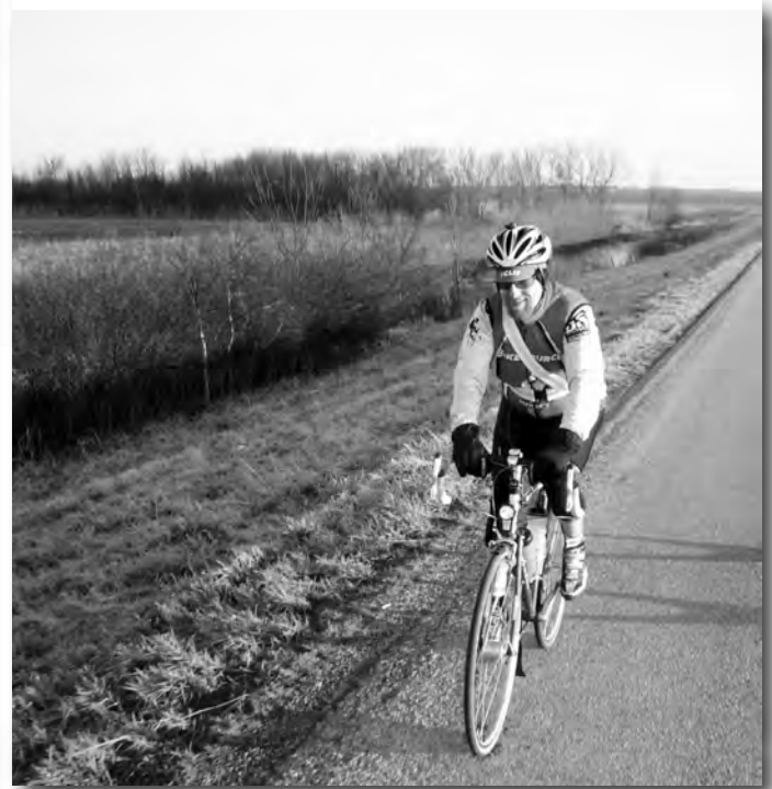
The author enjoying a brisk but sunny morning.