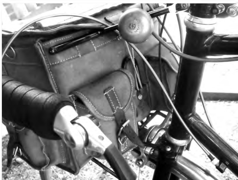
The decal for the front bag features a bell fitting.